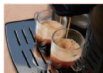
2-Cups One Touch