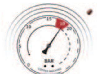
19 Bar Italian ULKA Water Pump