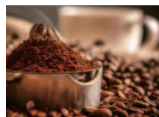
Bean or Ground Coffee