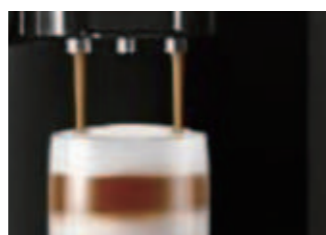
One Touch Cappuccino