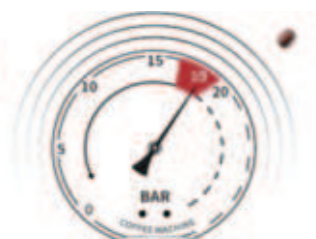
19 Bar Italian ULKA Water Pump