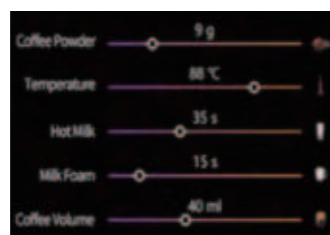
Coffee Taste Adjustable