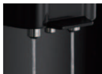
Self-cleaning each Turn On/Turn Off