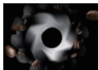
Cornical SS Burr