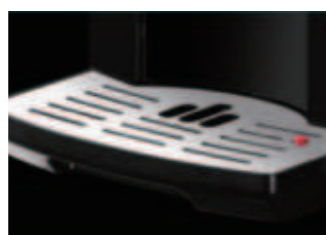
Remove Drip Tray