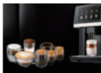
20 Specialty Drinks